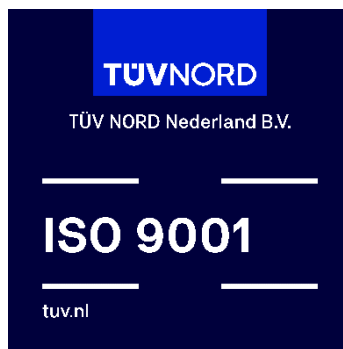
Example of the TÜV NORD Nederland mark of conformity

If the user is unsure about the correct use, he shall contact TÜV NORD Nederland for further instructions.